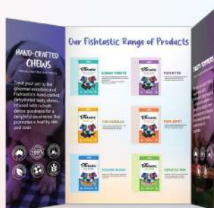
Gate Fold Flyer