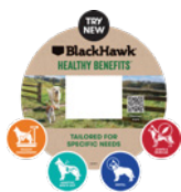
CIRCLE WOBBLER BHP941