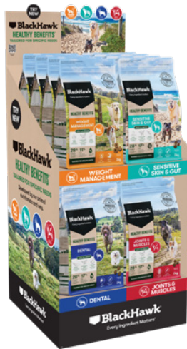
SINGLE TOWER UNIT FOR 2KG BHP942