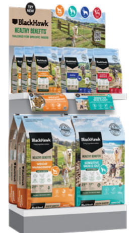
AISLE END HEADER CARD BHP963 SHELF TALKERS BHP937-BHP940

BH458 B/HWK DOG HB WEIGHT MANAGEMENT SAMPLES 100G BH452 B/HWK DOG HB SENSITIVE SKIN & GUT SAMPLES 120G BH461 B/HWK DOG HB DENTAL SAMPLES 100G BH449 B/HWK DOG HB JOINTS & MUSCLES SAMPLES 120G