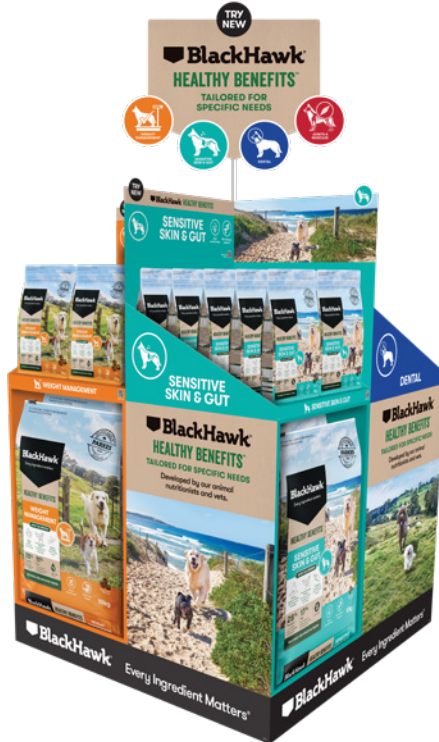
OFF LOCATION PALLET DISPLAY BHP935