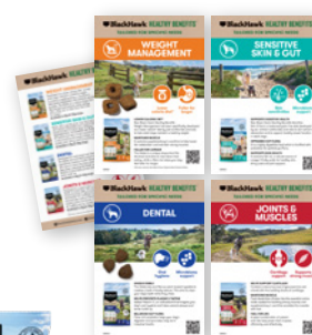
HEALTHY BENEFITS SAMPLE CARDS BHP951-BHP954