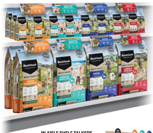
IN AISLE SHELF TALKERS BHP937-BHP940